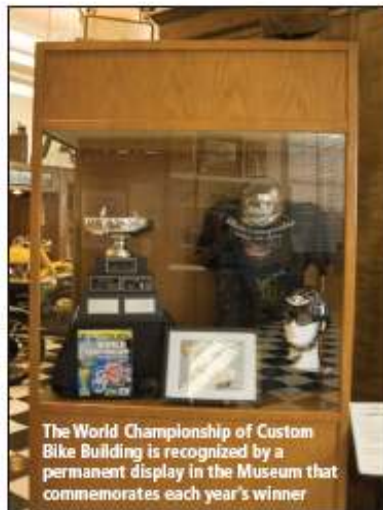
The World Championship of Custom Bike Building is recognized by a permanent display in the Museum that commemorates each year's winner