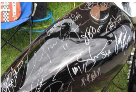
The tank is signed by many famous people making this raffle bike truly a one of a kind collectors item.

Tickets are $10 each or 3 for $20 and all proceeds go directly to the museum’s building fund. Thanks for the support!