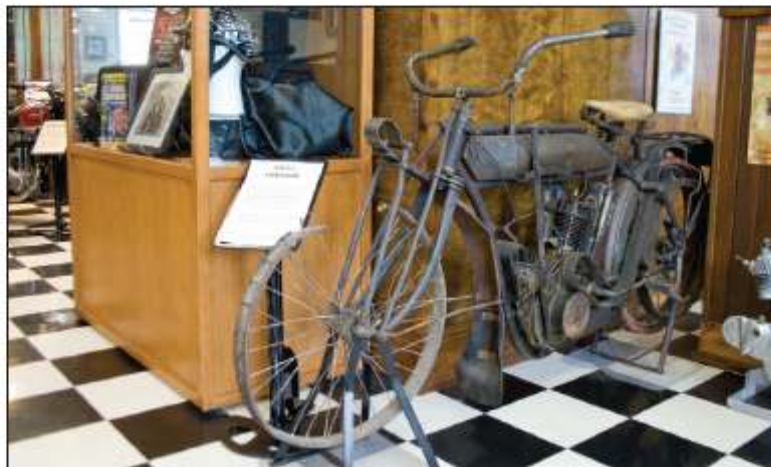
An unrestored Indian shows that a bike does not have to be in pristine condition to deserve its place in the Museum

"On my personal wish list, I'd love to have a WLA from the war, things like that that would round out the collection. I know they are around, I just don't have one yet. People are very interested in old military motorcycles, so it would be great to have. One that had seen actual military service would be