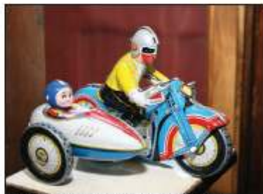
Tin toys are included in the motorcycling memorabilia on display at the Museum

chooses the nominees each year from those submitted, this is made up of 11 volunteers. While some of the Board have Rally related businesses, others are involved in related activities like H.O.G. or are simply interested in the history of motorcycling. In fact, a couple of the members are previous city councilors, who joined as the city's reps and then stayed on afterwards, such was the impact of being actively involved with the Museum.