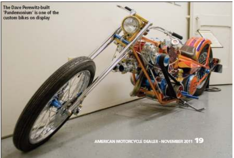
The Dave Perewitz-built 'Pandemonium' is one of the custom bikes on display