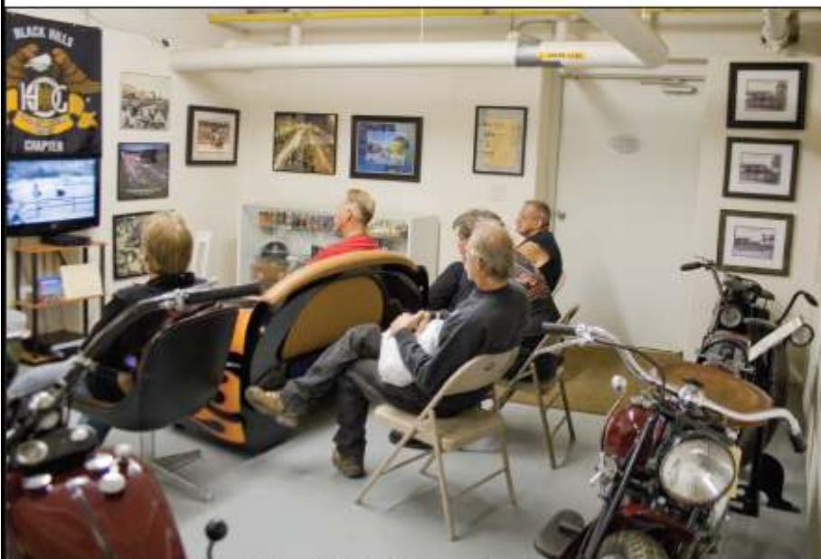
Films recounting the history of the Sturgis Rally are shown in the lower level of the Museum